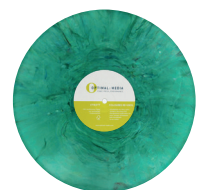
Coloured Re-Vinyl (random colour composition)